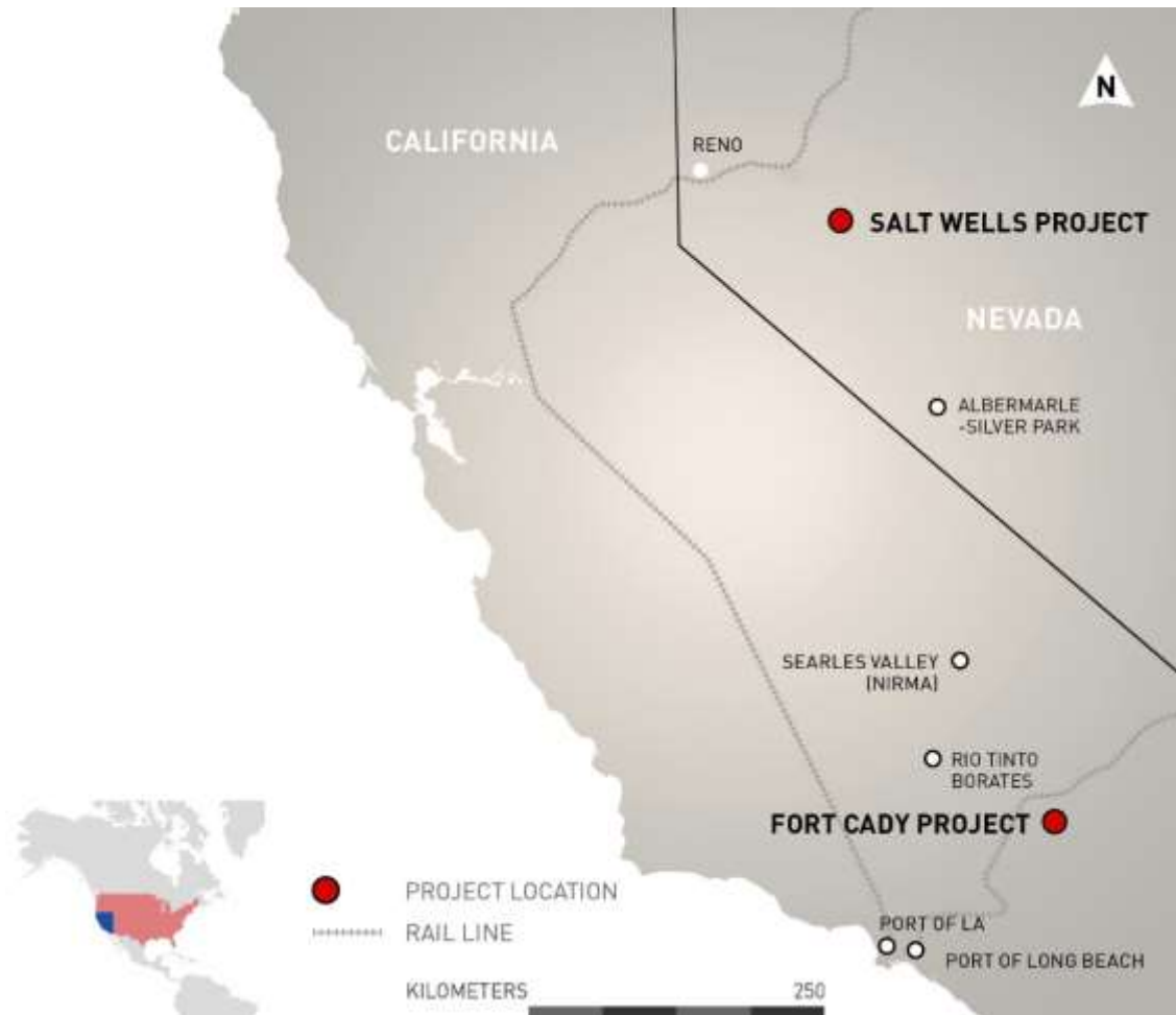
Location of the Fort Cady and Salt Wells Projects in the USA